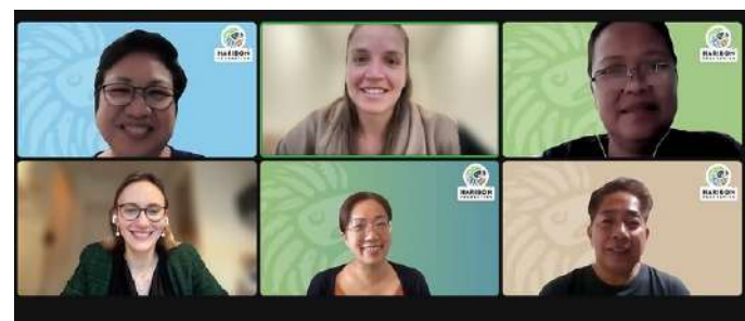
Greenseed and Haribon Foundation collaborating

A significant milestone in 2023 was the establishment of the WePhili Programme, a testament to our dedication to empowering women in the Philippines for the conservation of endemic species. Numerous meetings with our local partner, Haribon Foundation, paved the way for the programme's development. Collaboratively, we laid the groundwork, and with intentions set high, we anticipate the programme's launch in 2024.