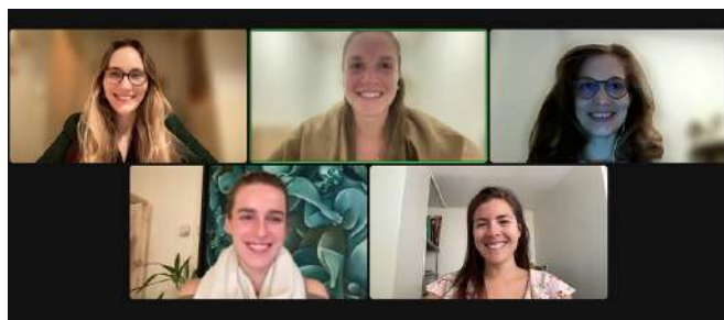
Greenseed's Committee and co-directors

On June 23, 2023, Greenseed was officially founded during a constitutive assembly with the committee. This significant event marked the inception of the association, signaling the commencement of our official activities. Since then, Greenseed has been dedicated to working towards its mission, fostering positive change by addressing gender inequality and environmental degradation with compassion and commitment.